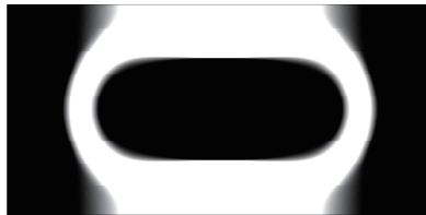
Figure 3 Optimal solution of (4.5) with \varepsilon = 3 .